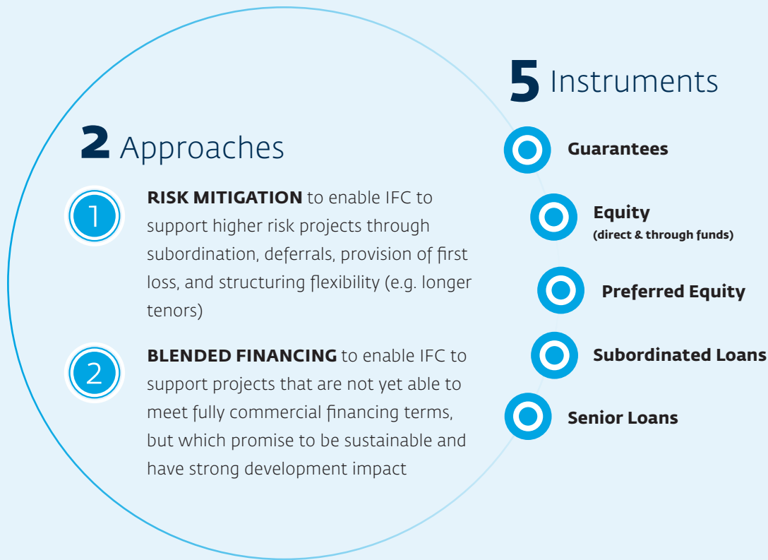
Figure 3: IDA-PSW Blended Finance Facility

a vibrant private sector. The PSW will provide a pathway and more bankable projects that will help expand IFC's footprint in Africa.