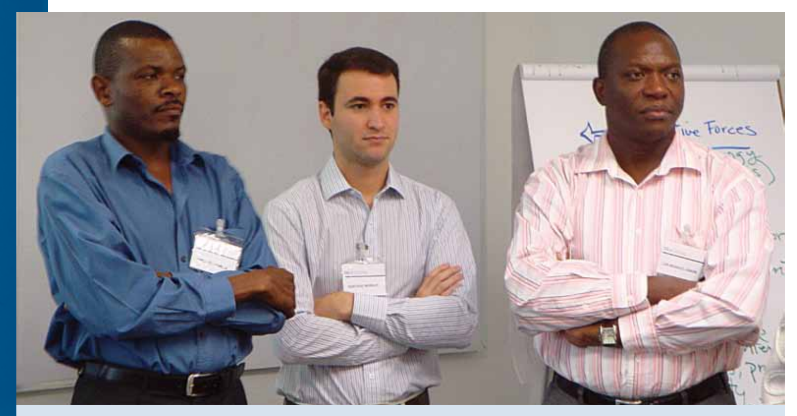
Mozambicans and Brazilians working together during a training session in Brazil. (2009)