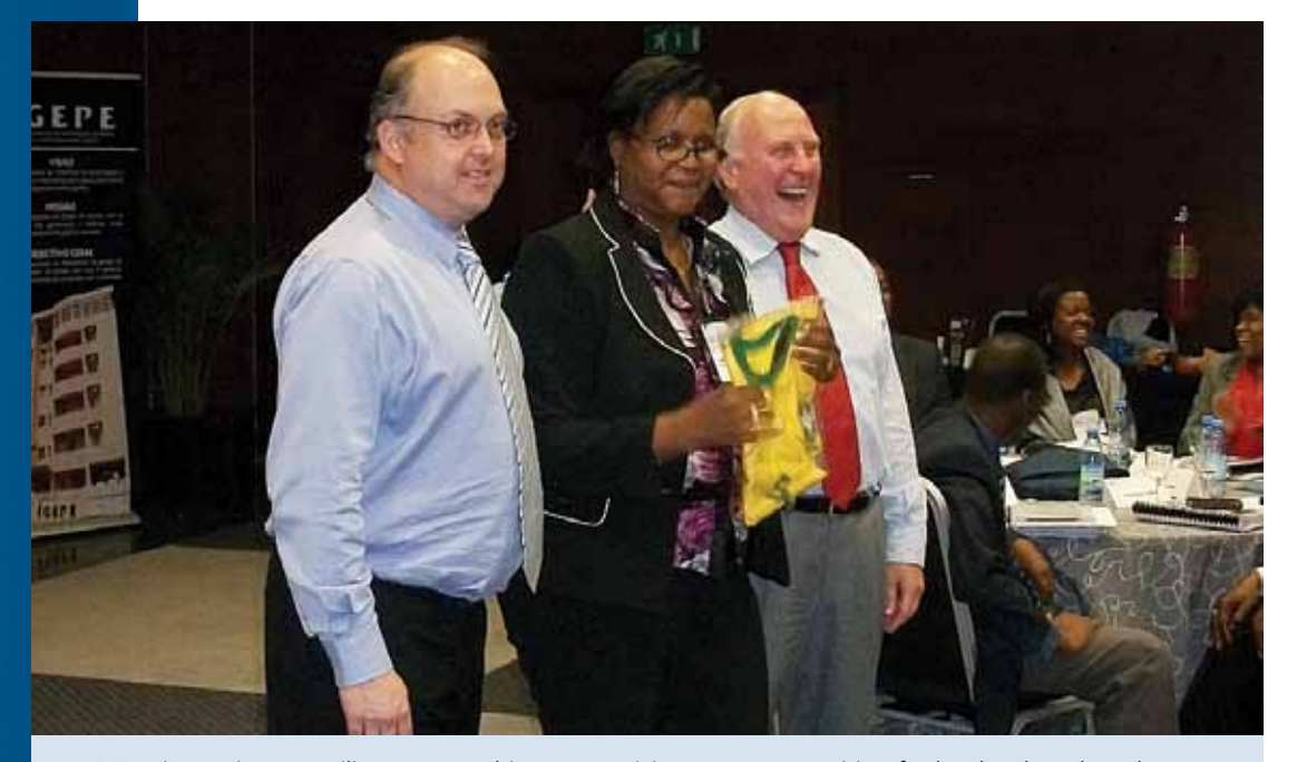
IBGC trainers give a Brazilian soccer t-shirt to a participant as a recognition for her hard work at the training held in Maputo. (2010)