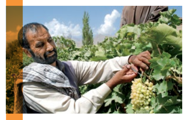
Photo (above): The IFC-funded Rikweda raisinprocessing plant is helping 3,000 smallholder farmers in Afghanistan — by buying their produce at higher prices.

In 2018, the World Bank Group used a new tool — the IDA18 IFC-MIGA Private Sector Window — to help Afghanistan's Rikweda Fruit Processing Company build a state-of-theart raisin-processing plant. Once operational, the plant will double the country's production of raisins and support 3,000 smallholder farmers by buying their produce.