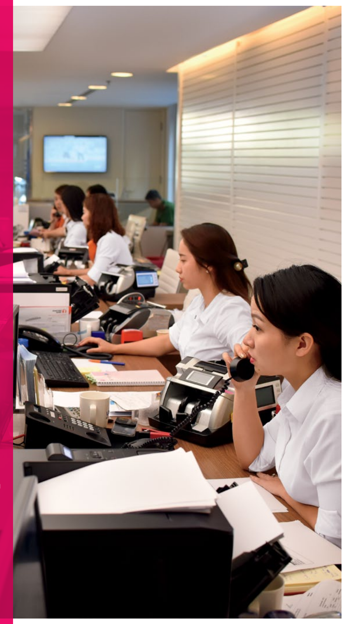
Photo: IFC financing is helping Vietnam International Commercial Joint Stock Bank widen its portfolio of affordable SME Ioans.