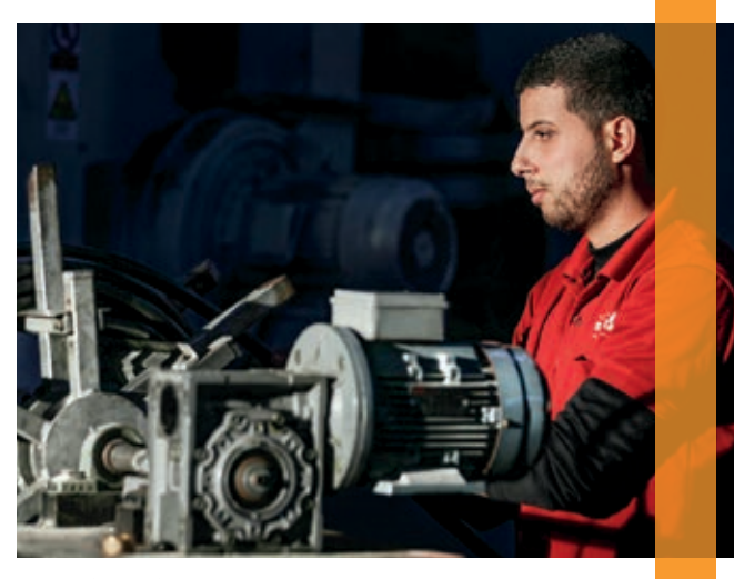
Photo (above): A worker making plastic parts in a Gaza industrial park, where IFC financed a 7-megawatt solar plant that helped create 800 jobs.

In Egypt, IFC made a $75 million equity investment in Apex International Energy, which aims to be the country's largest oil-and-gas production platform. IFC Asset Management Company mobilized an additional $25 million for the project. The project is expected to increase Egypt's oil-andgas reserves by the equivalent of 100 million barrels of oil by 2023.