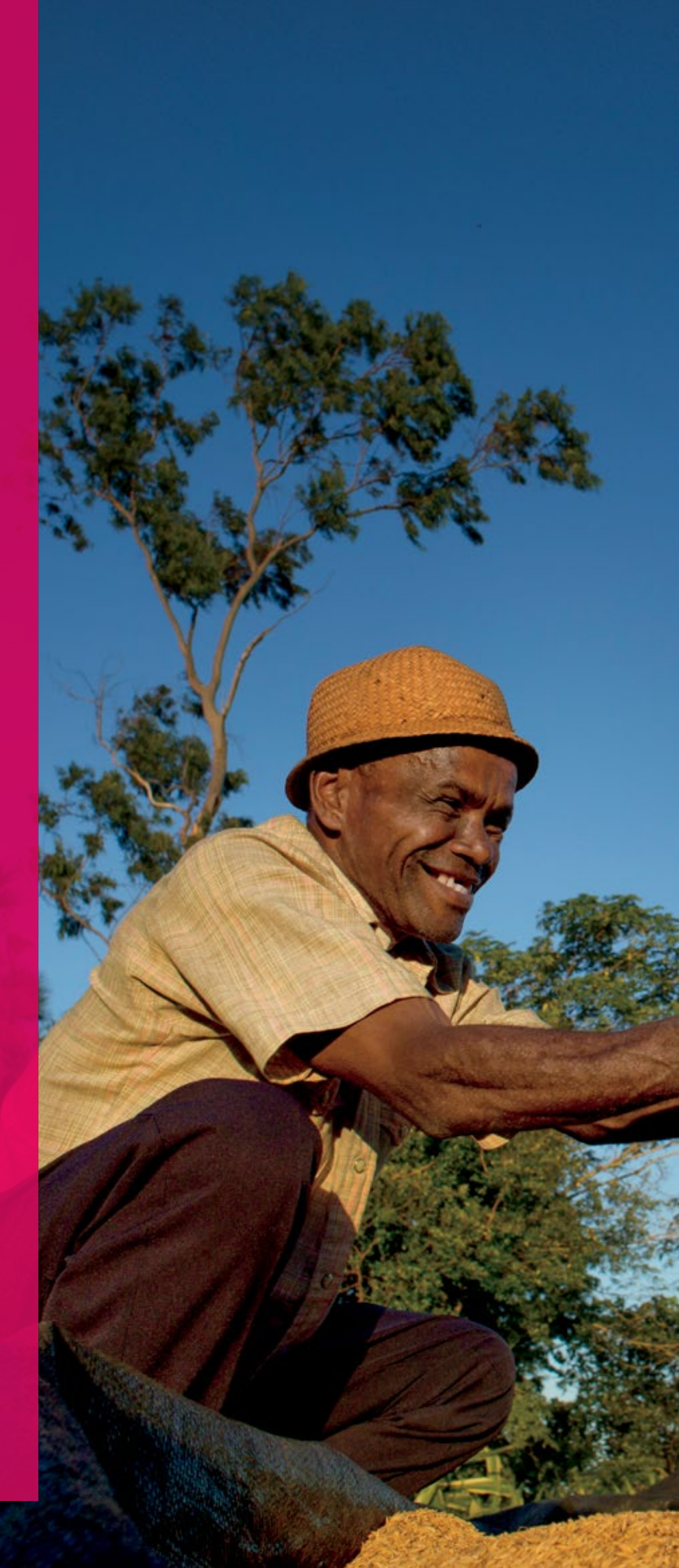
Photo: In the least-developed countries, IFC helps reduce investment risks to attract private finance that will benefit the poor.