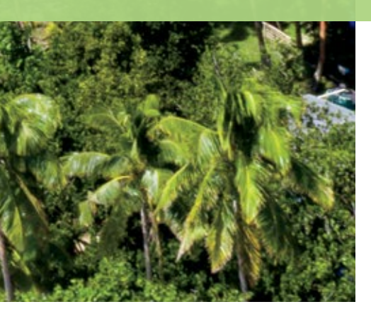
Photo: IFC helped the island nation of Fiji raise $50 million through a sovereign green bond.

Private investors increasingly have the appetite and capacity to invest in climate-smart projects in emerging markets. Yet they often lack the proper tools to make investments happen.