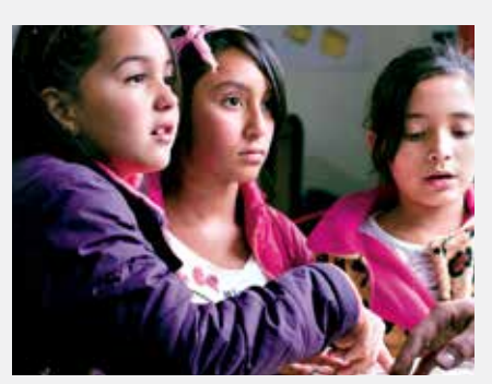
IFC IS UNIQUELY POSITIONED TO LEAD.