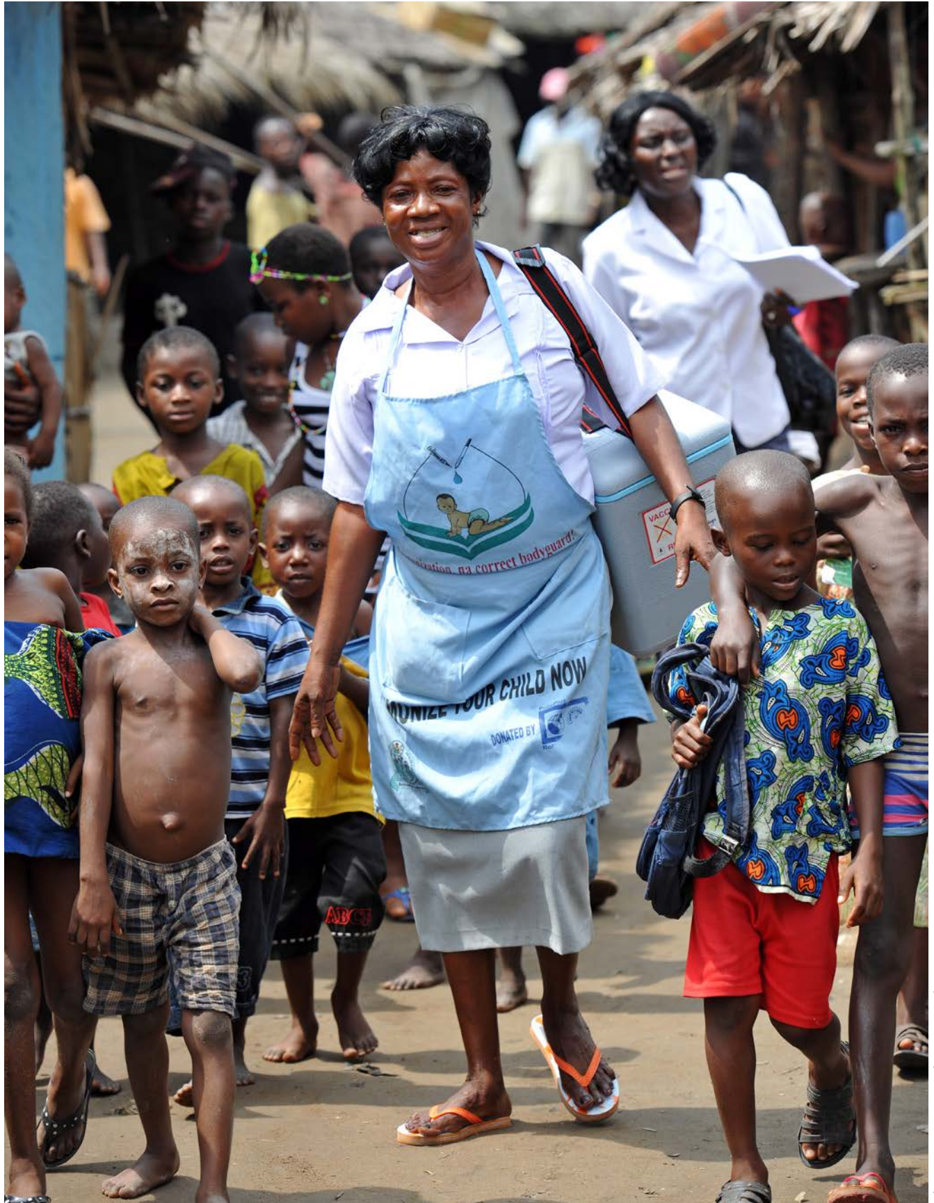
A partnership led by the Bill and Melinda Gates Foundation developed ways to overcome structural obstacles to market development, so that more vaccine producers could enter the market with more affordable products.