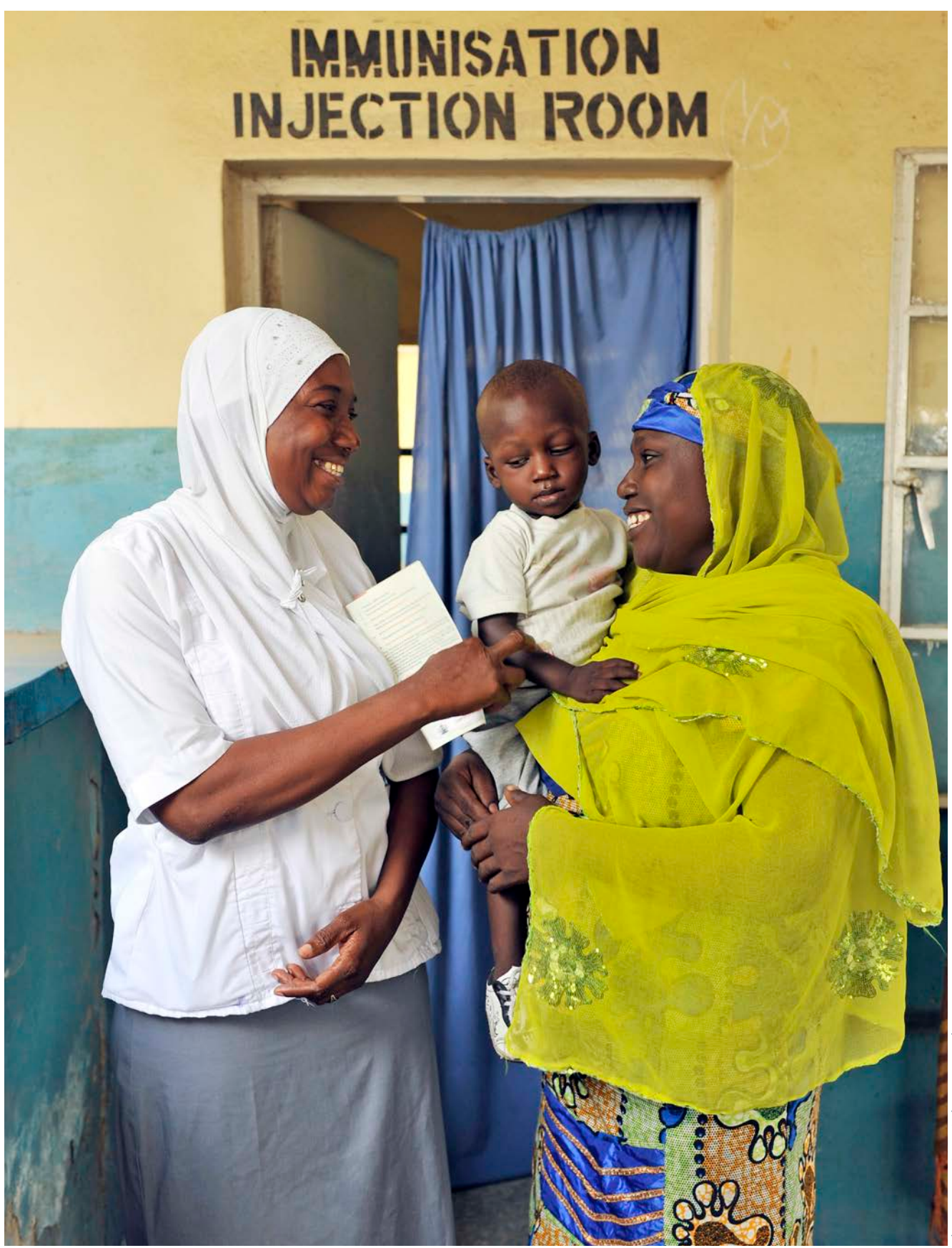
Nearly one-third of deaths of children under five years old can be prevented with vaccines.