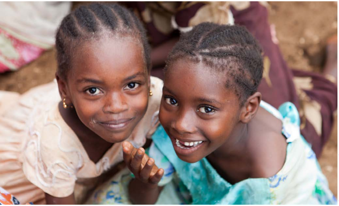
BioE's vaccines help children to lead healthy lives and to celebrate life.

BioE has played an important role in bringing affordable access to vaccines to children around the world. It is helping to equalize access between children living in developed countries and those born into in fragile environments. The Gates Foundation and its partners created a sustainable marketplace that has made the price of vaccines much more affordable. BioE's quality and ability to service large-scale orders has sparked greater competition that has helped drive prices down globally. As BioE continues to introduce new vaccines, more children than ever have received life-saving immunizations that protect them from devastating diseases. BioE's vaccines help children to lead healthy lives and to celebrate life.