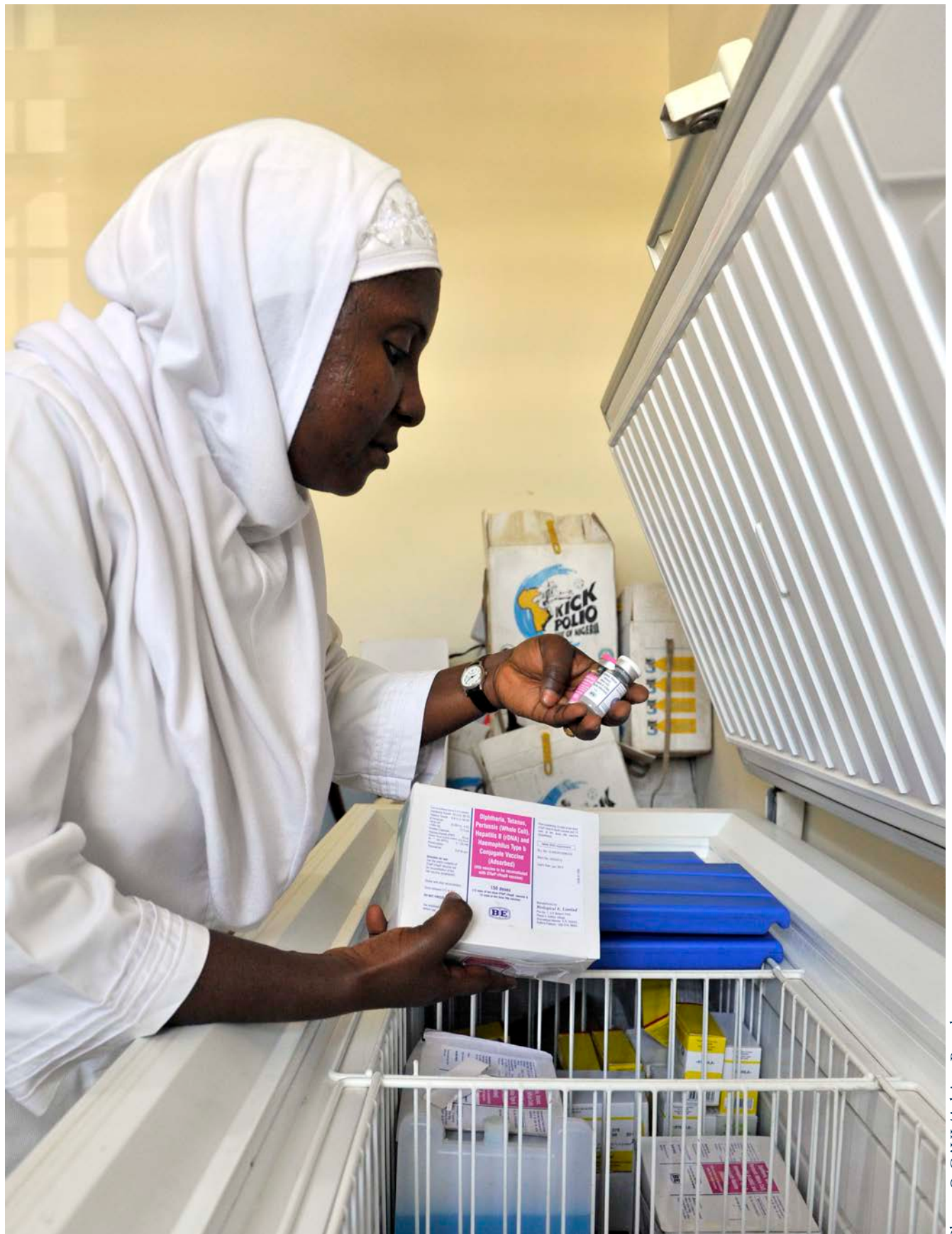
"Companies, especially those with long-gestation R&D, like working with IFC because we are a patient capital provider and we value the partnership over the long run."