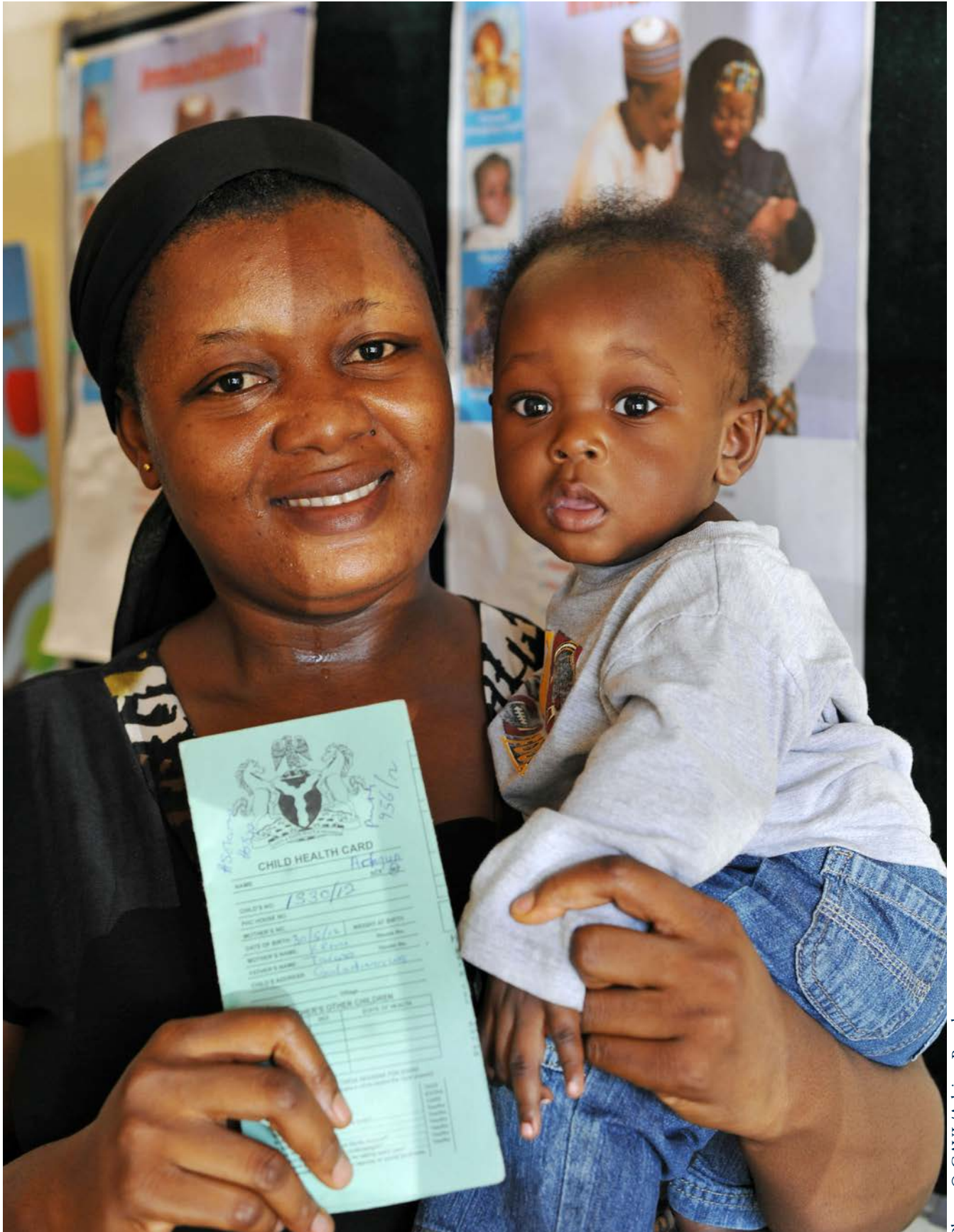
BioE has played an important role in bringing affordable access to vaccines to children around the world.