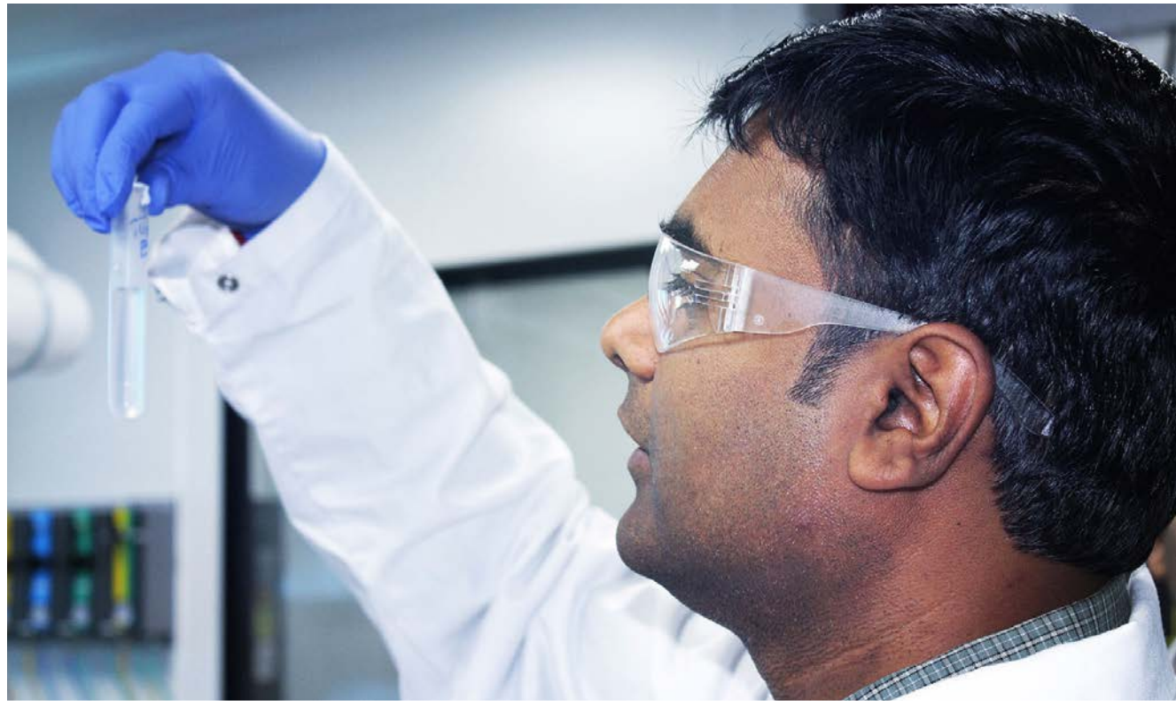
BioE's technological strength has allowed it to partner with large multinational companies such as GlaxoSmithKline (GSK) for the development of Hexavalent.