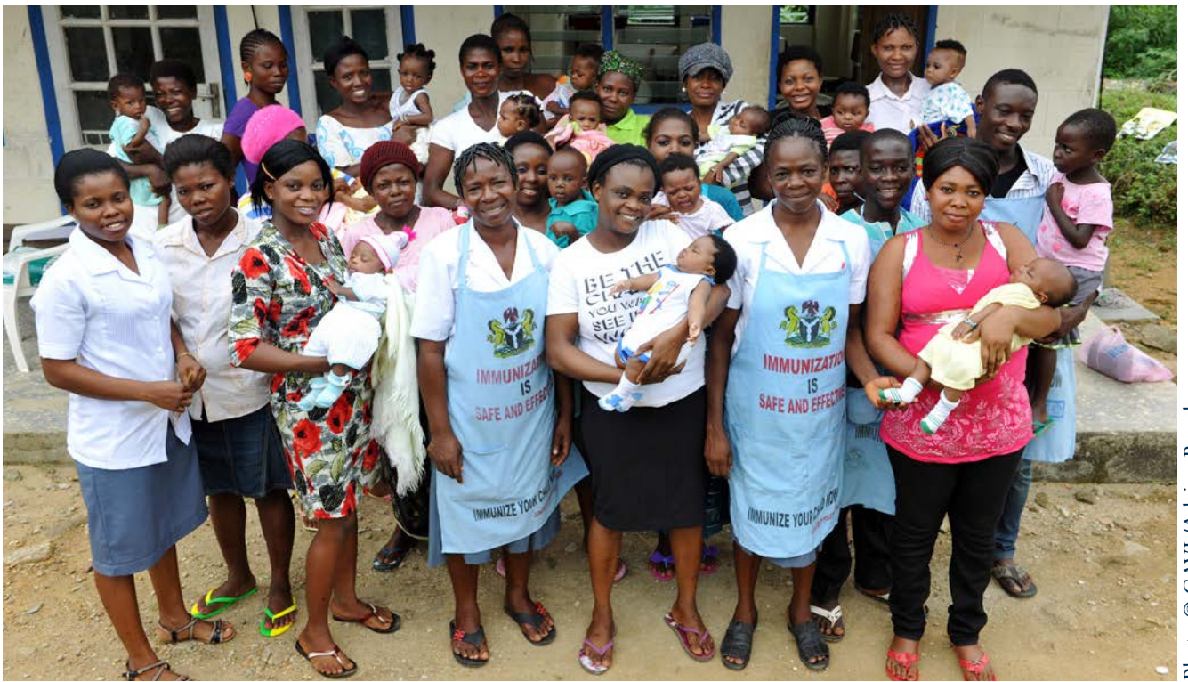
Between 2012 and 2017, BioE supplied more than 2 billion doses of multiple vaccines to children across the globe, and the company has emerged as a leading global supplier.

UNICEF evaluates proposals on a variety of criteria including WHO pre-qualification, reliability and consistency of quality supply over several years, competitiveness of price, and volume capacity. These factors are designed to ensure a diverse supply base and to reduce reliance on a single producer in the event of interruptions in supply. UNICEF tries to ensure that all participants have enough demand to remain a sustainable provider.