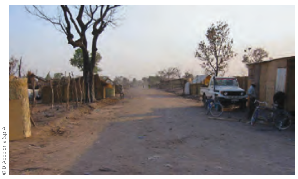
Image 22. A new street in Komé Atan settlement, Chad, near the Chad-Cameroon Oil Pipeline Project. After the 2002 and 2003 fires, the local government and the Oil Consortium worked together to develop an organized village layout with wider streets.