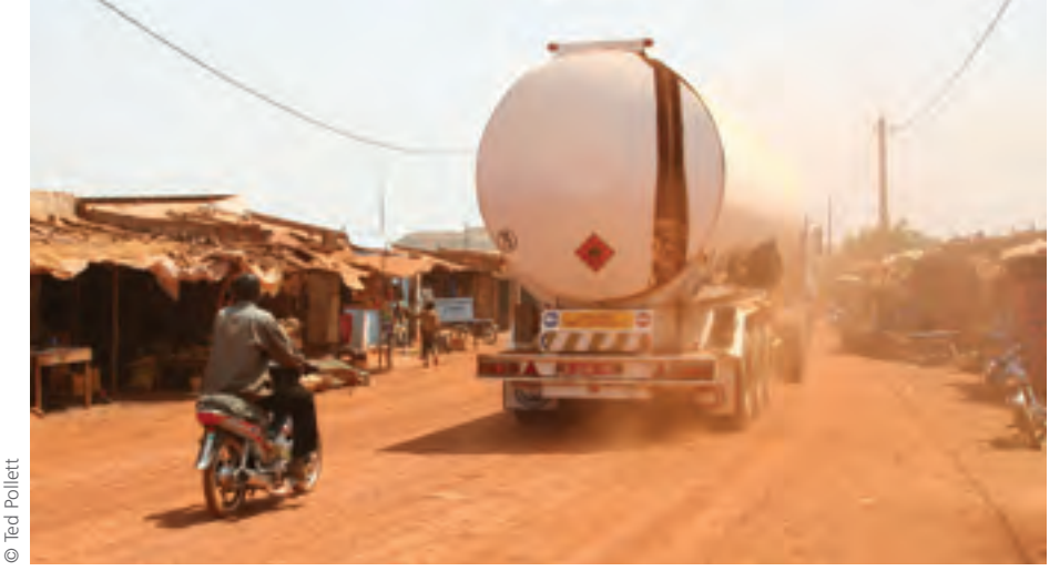
Image 17. The Sadiola Gold Mine is located in a remote area in north-west Mali. The Project relies heavily on vehicular transport to supply the operations. One consequence of a regular trucking schedule reliant on an established access route, has been the proliferation of road-side shops, the majority of which have been established by and are operated by migrants. Besides obvious health and safety issues with unplanned roadside development, the migrant capture of such small business opportunities represents a missed opportunity for local people.