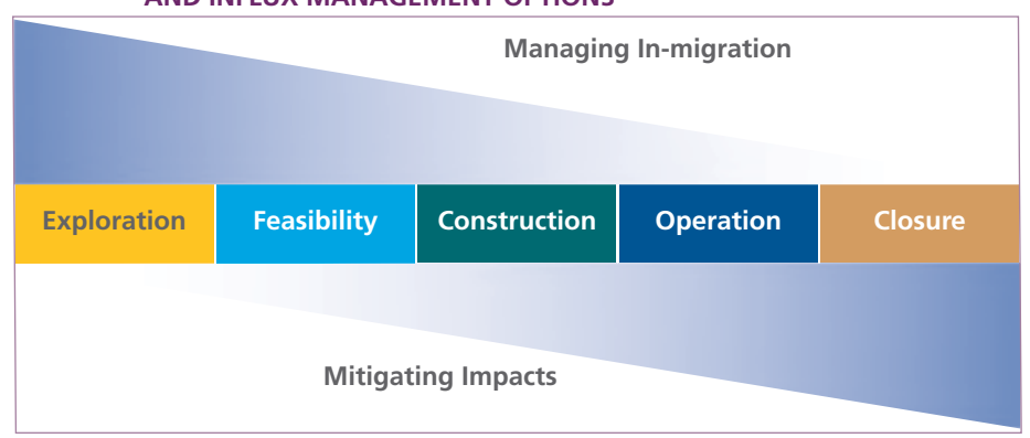
FIGURE 8. RELATIONSHIP BETWEEN THE PROJECT CYCLE AND INFLUX MANAGEMENT OPTIONS

Figure 8 illustrates the relative emphasis on project design and early planning and implementation or management of influx impacts based on when, within the project cycle, the issue is identified and addressed.