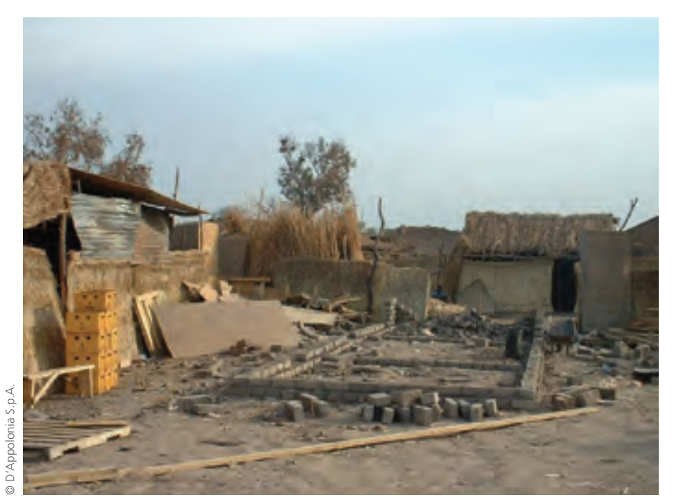
Image 21. Komé Atan settlement, Chad near Chad Cameroon Oil Pipeline Project. After the 2002 and 2003, fires an increasing number of houses were built using permanent materials allowing Komé Atan to evolve from an informal, albeit long-established settlement into a new village recognized by local government.