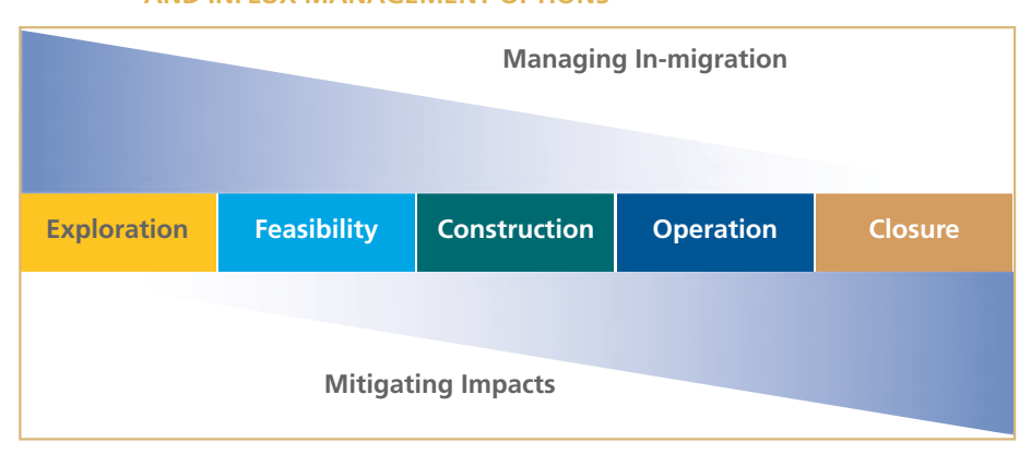
FIGURE 3. RELATIONSHIP BETWEEN THE PROJECT CYCLE AND INFLUX MANAGEMENT OPTIONS

Pro-active management requires leadership and timely decision-making to allow integration of social criteria into project design. Where management is reactive and occurs relatively late in the project cycle, when in-migrants are on the doorstep and their impacts are tangible, the majority of resources will be allocated towards mitigating the symptoms. As such, it will be increasingly difficult to achieve the objectives outlined in the paragraph above.