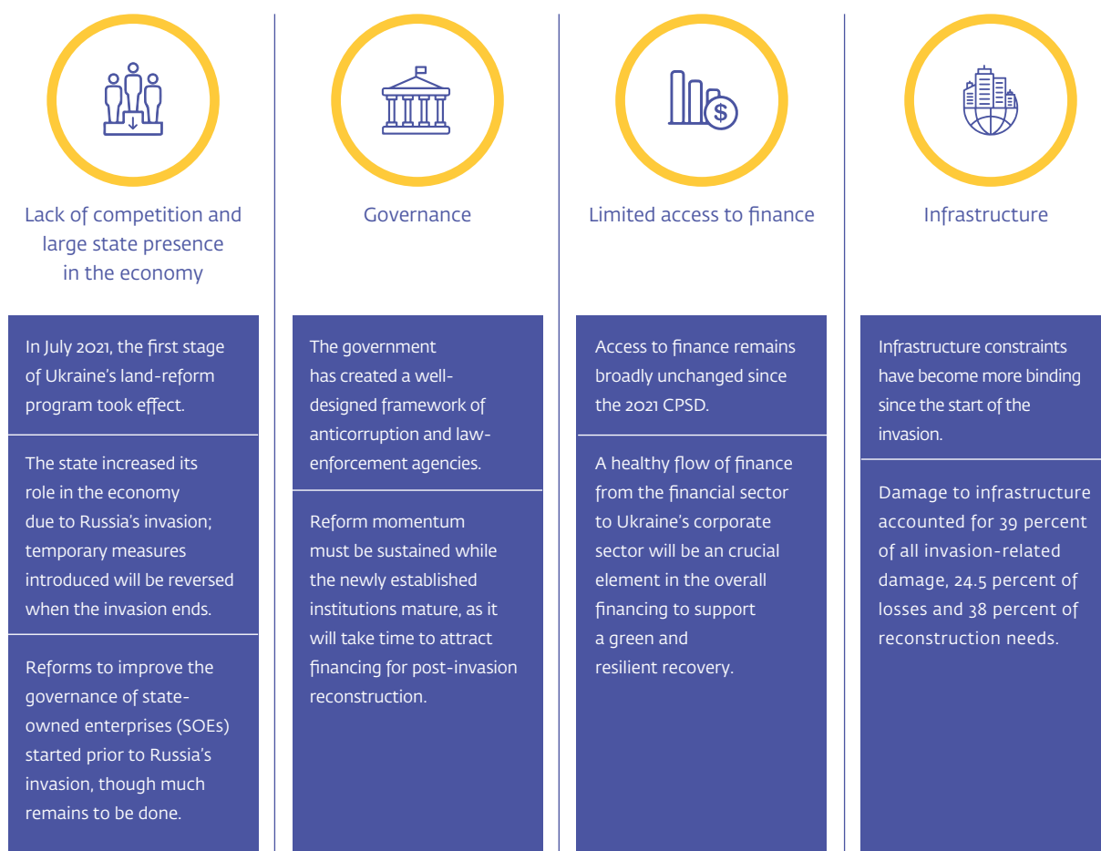
Figure 1 Update on the Constraints on Private Sector Growth Identified in 2021 Country Private Sector Diagnostic